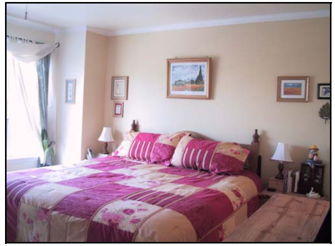
Master Suite with large bay window