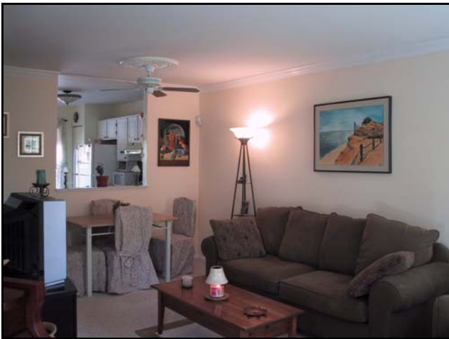
Living Room and Dining Room with access to deck