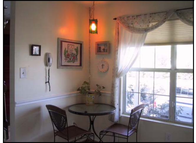
Large double window in kitchen