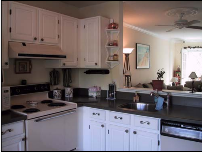
Updated kitchen with pass-through